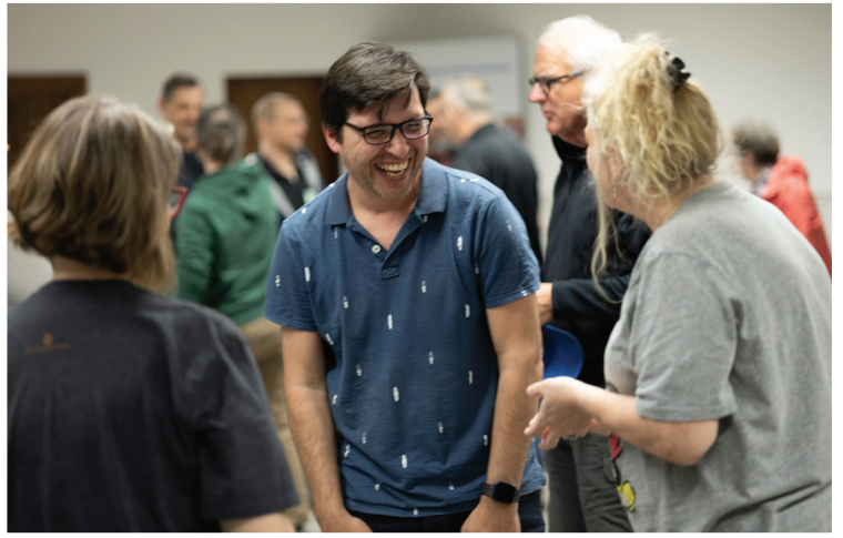
The joy of being back at the Haus!

Just as you have made adjustments to negotiate changes in your daily life, TCM remains flexible and agile to face the future. Fortunately we serve a King Who does not change.