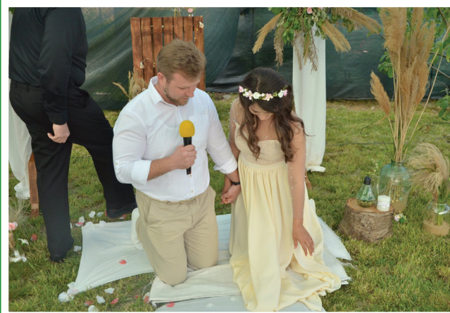
But Life Goes On - A Recent Wedding in Ukraine