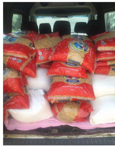
Van loaded with supplies for Ukraine