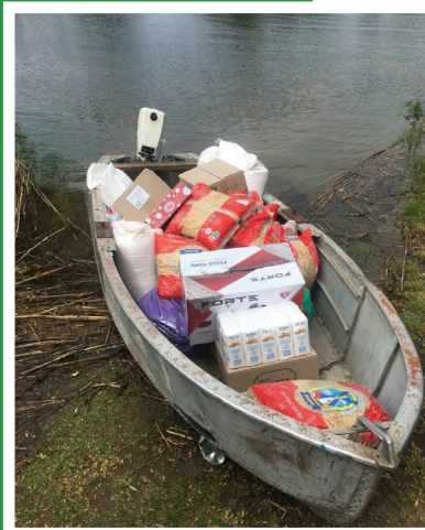
Supplies to be delivered by boat in Ukraine