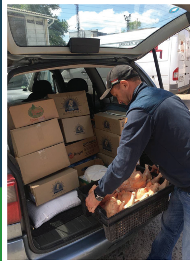
Loading Van with supplies for people in Ukraine

THANK YOU! To the right are some photos of friends that have been blessed by the love of Christ provided through your help and prayers. Because of you perhaps their days have not seemed so endless and without hope.