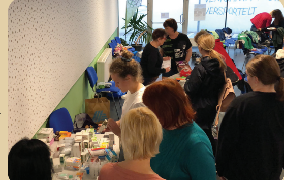
Distributing Supplies to Refugees