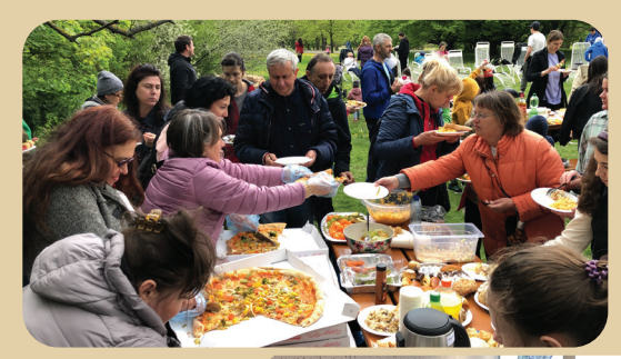
Refugees at Vienna Easter Picnic

"The Lord has strategically located our family to serve people during the time of the Ukrainian war. If my understanding of God's dealings with Empires is correct, it is not the last wave of migration from Eurasia. It is a great blessing to participate in the Great Commission of the Lord under the guidance of His Spirit."