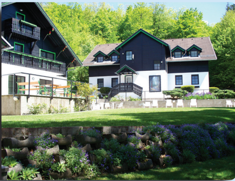
Haus and Leadership Training Center