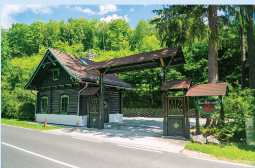
Gate Haus of Prayer

with the purchase of TCM's European Center for Evangelism; "That six acres of land with the Hospitality House and the other excellent facilities is indeed the center of evangelism. Without this base of operation right on the doorstep of those eastern European countries very little of the progress I'm writing about would have been possible." He went on to list ten of the ways that this place, that soon came to be known as Haus Edelweiss, had "served for God's glory":