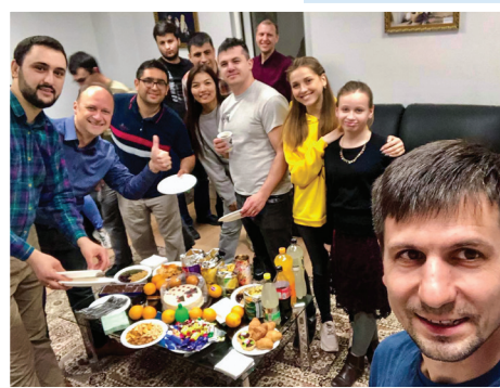
Fellowship Party for Disciple Making students

a time for them that is spiritually refreshing, and serves as a retreat. I do not want them to be stressed out. Many of them are coming from non-healthy church environments. Just as anybody else, they carry huge burdens: health issues, family-related difficulties, conflicts. Several of them are persecuted Christians. This special fellowship – and especially the fact their professor is opening his home for them, has been proved many times as a time of healing for many.